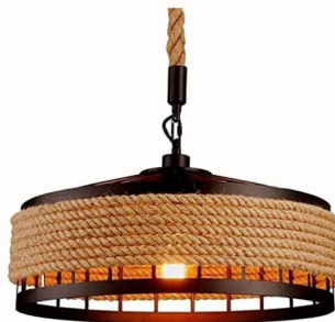
HANGING LIGHT INCLUDED