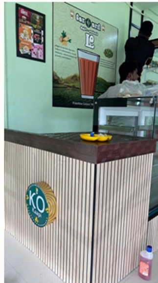
INTERIER SETUP WODDEN TABLE 5FT INCLUDED (3 QTY)