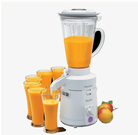
MIXER JUICER INCLUDED