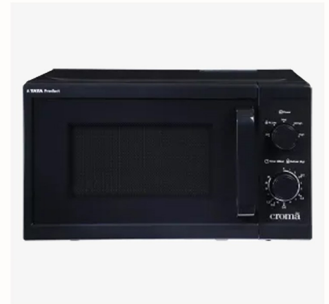
MICROWAVE SOLO INCLUDED