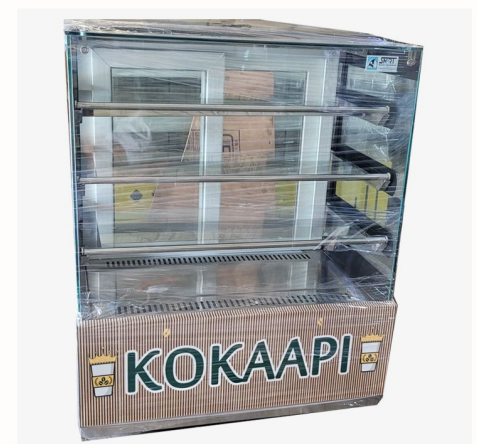
HEATER SHOWCASE 3X4 FT INCLUDED