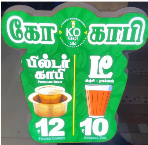
LOLLYPOP LED BOARD INCLUDED