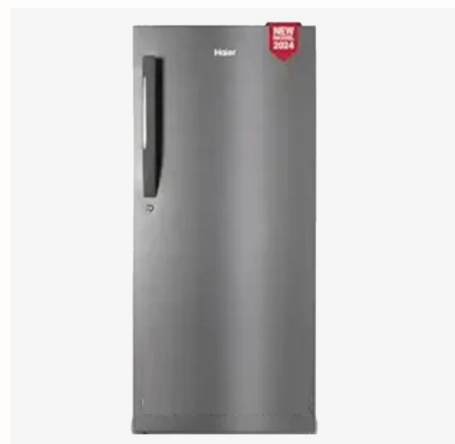
REFRIGERATOR 185~190 L INCLUDED