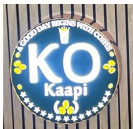
LED LOGO INCLUDED (2 QTY)