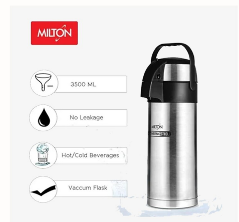
BEVERAGE FLASK 3+ LTR INCLUDED