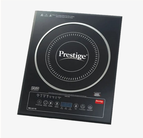
INDUCTION STOVE INCLUDED (2 QTY)