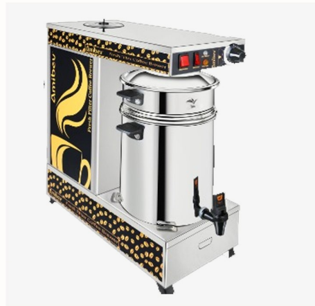
FILTER COFFEE MACHINE INCLUDED