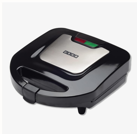
SANDWICH GRILLER INCLUDED