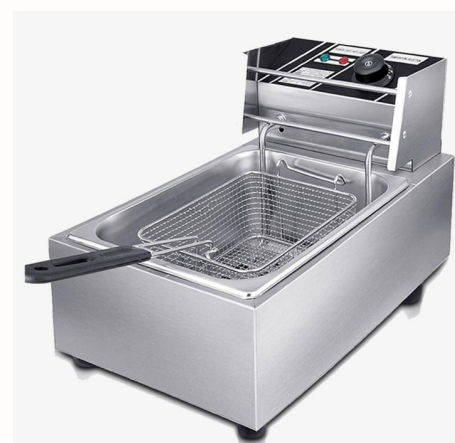
COMMERCIAL FRYER INCLUDED