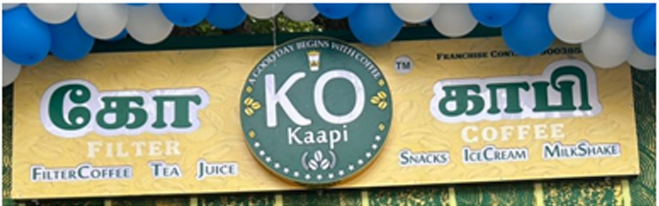
LED Board 2 X 8 FT INCLUDED