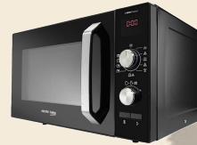
04 Microwave Solo