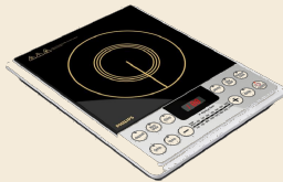
02 Branded Electric Stove