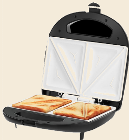
08 Sandwich Maker