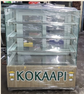
07 Display Warmer