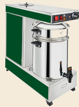
03 Filter Coffee Machine