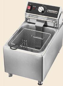
09 Oil Fryer